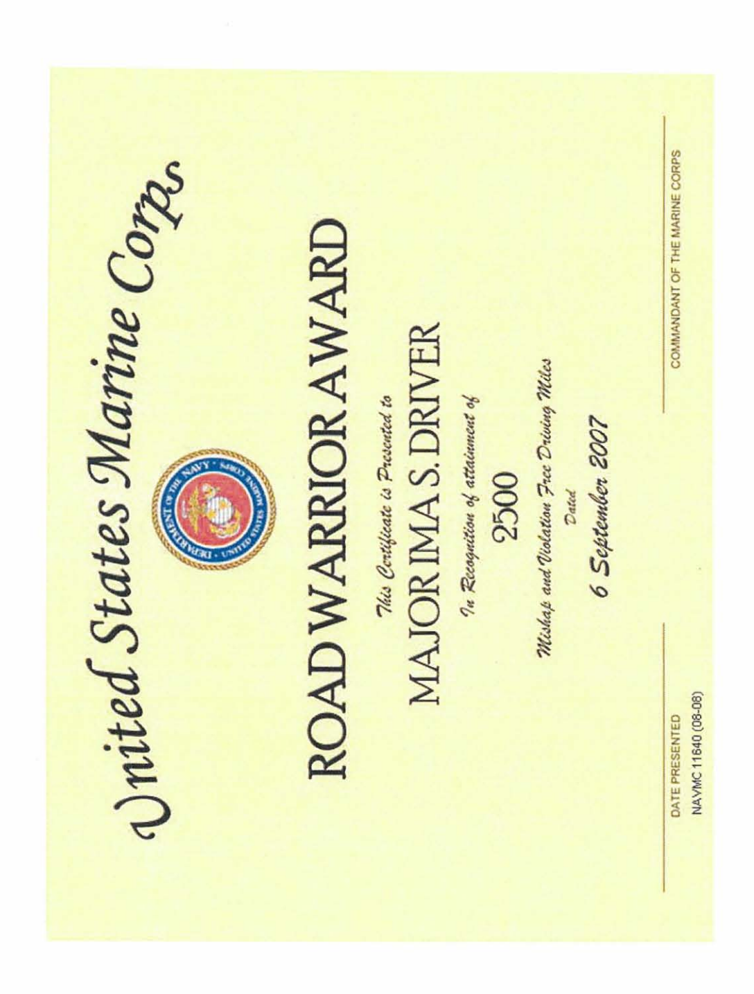
Figure 1-1.--Example Individual Road Warrior Award